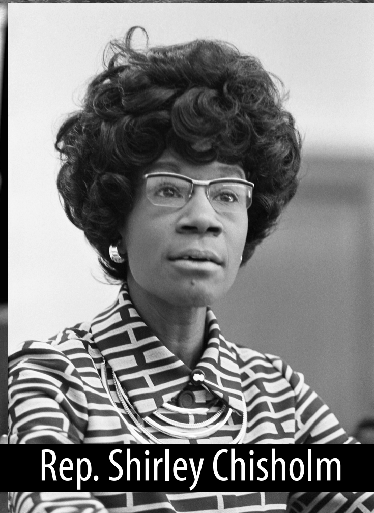
Rep. Shirley Chisholm