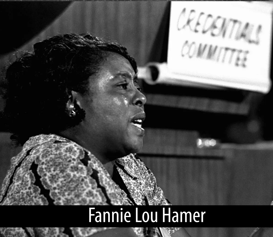
Fannie Lou Hamer