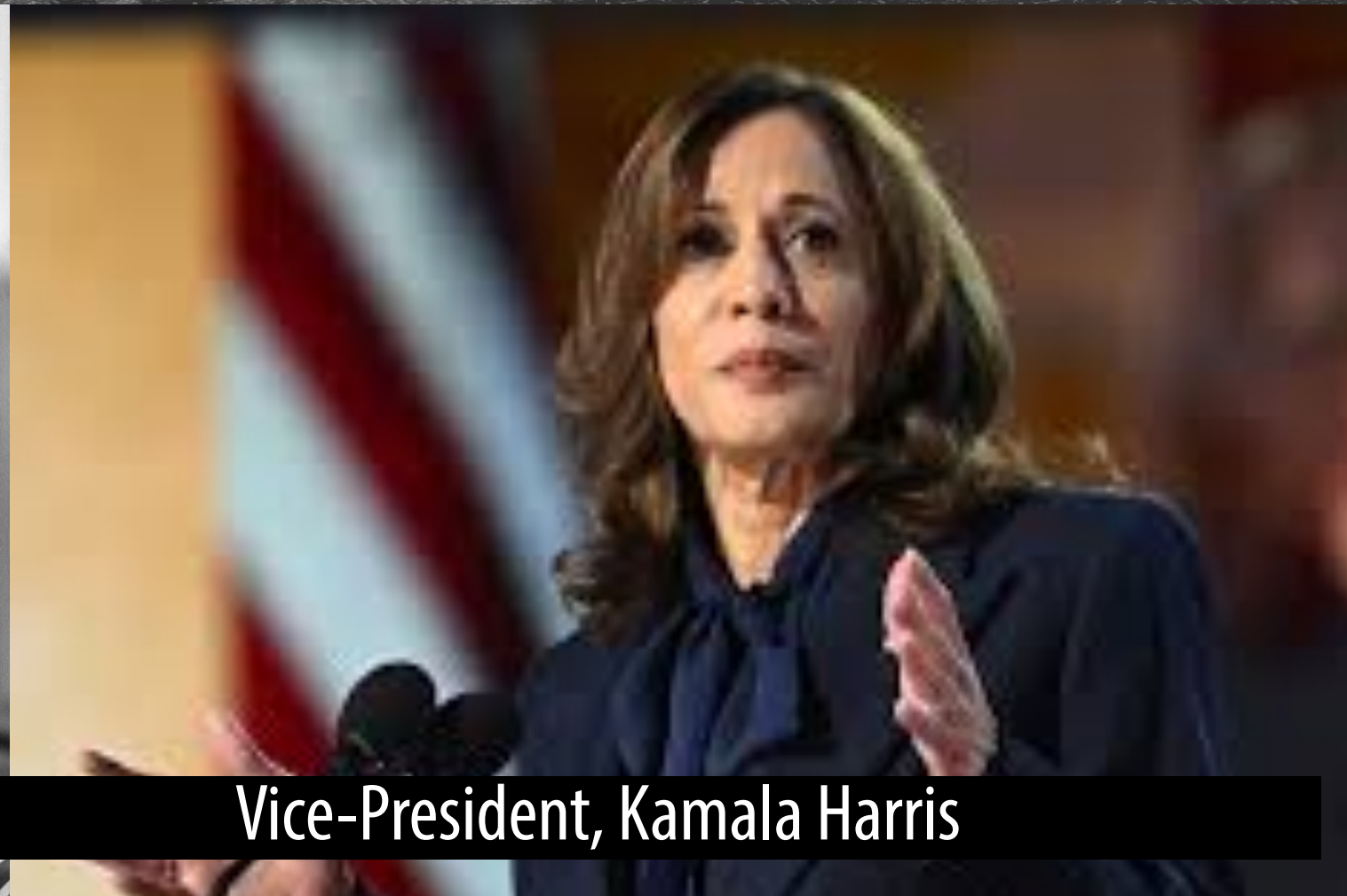
Vice-President, Kamala Harris